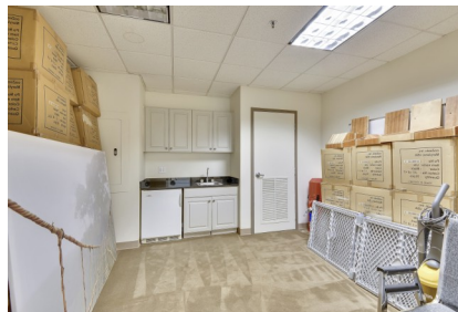
Office #1 (10X12)

Break room with kitchenette featuring granite countertops and refrigerator (16X11)